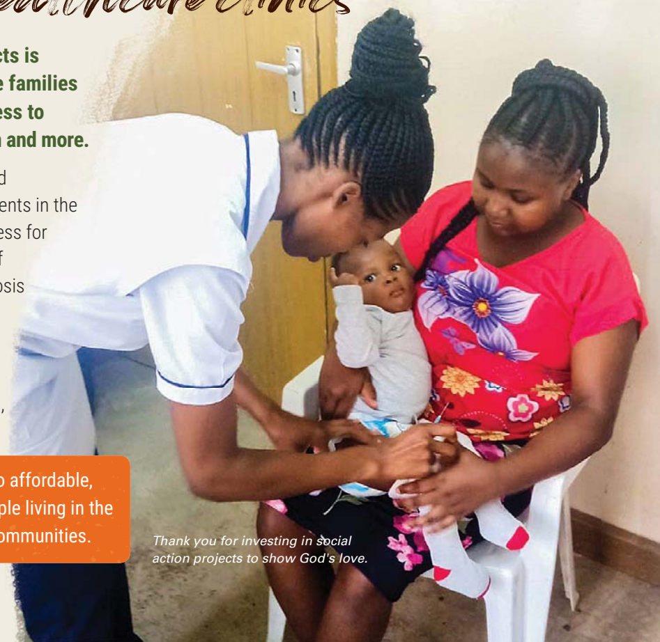
Thank you for investing in social action projects to show God's love.

Thank you for your help to improve access to affordable, quality health services for thousands of people living in the Soweto Kayole slums and the surrounding communities.