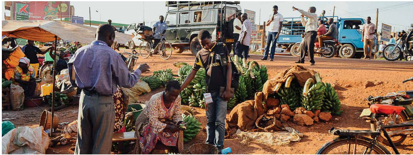
Reaching out to people of all walks of life. Evangelism pictured! Kampala Mission, Uganda 2018