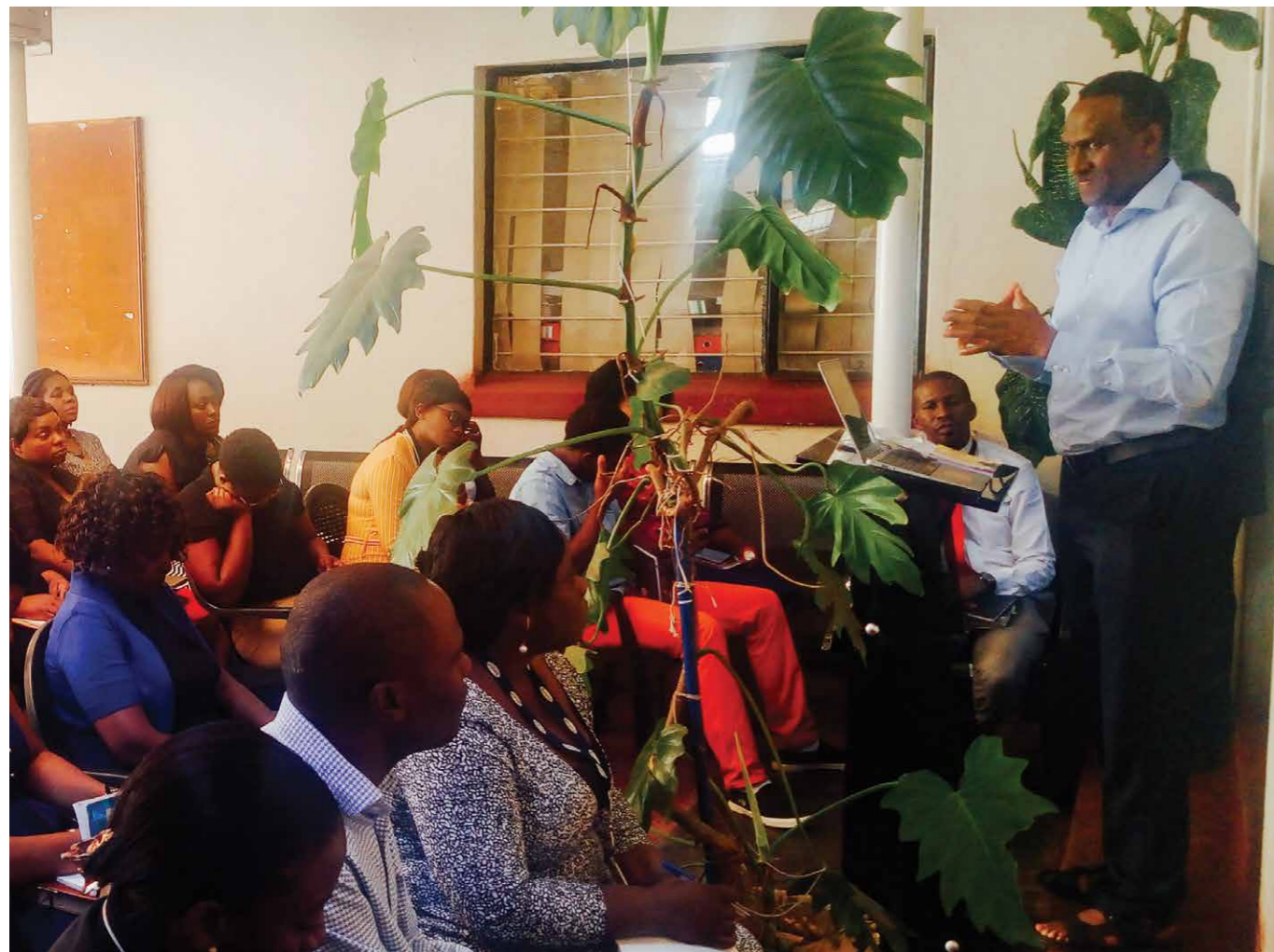
Leadership care and outreach