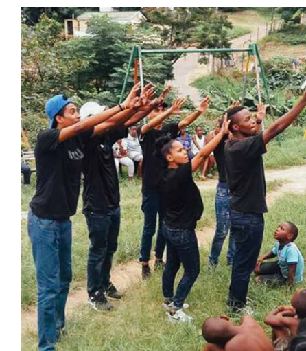
Foxfires in action