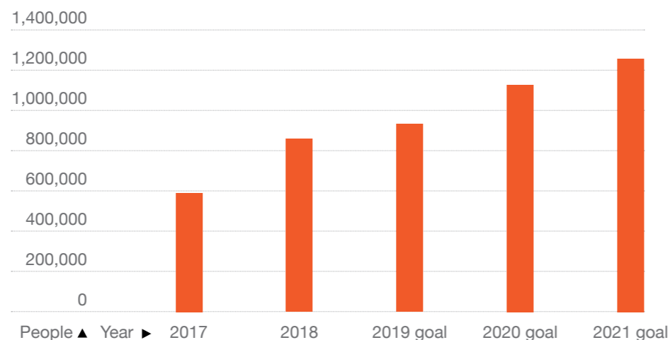
Approximately ten percent of all people reached make a commitment to Christ