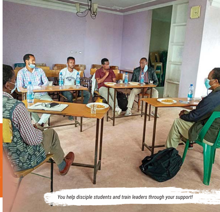
You help disciple students and train leaders through your support!