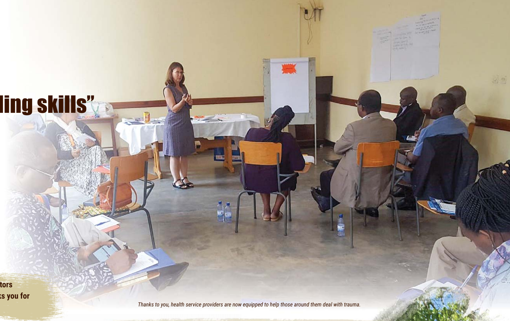
Thanks to you, health service providers are now equipped to help those around them deal with trauma.

"The trauma-healing training also addressed some of the critical questions that I frequently encounter in the church, including why people suffer if God loves them. This training showed me that, as a church leader, I have a role to play to help people who have faced difficult events – like the loss of a loved one, sickness or domestic violence – to find healing from God through biblical and mental health principles."