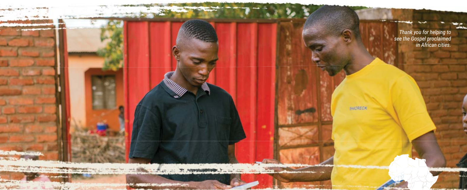
Thank you for helping to see the Gospel proclaimed in African cities.