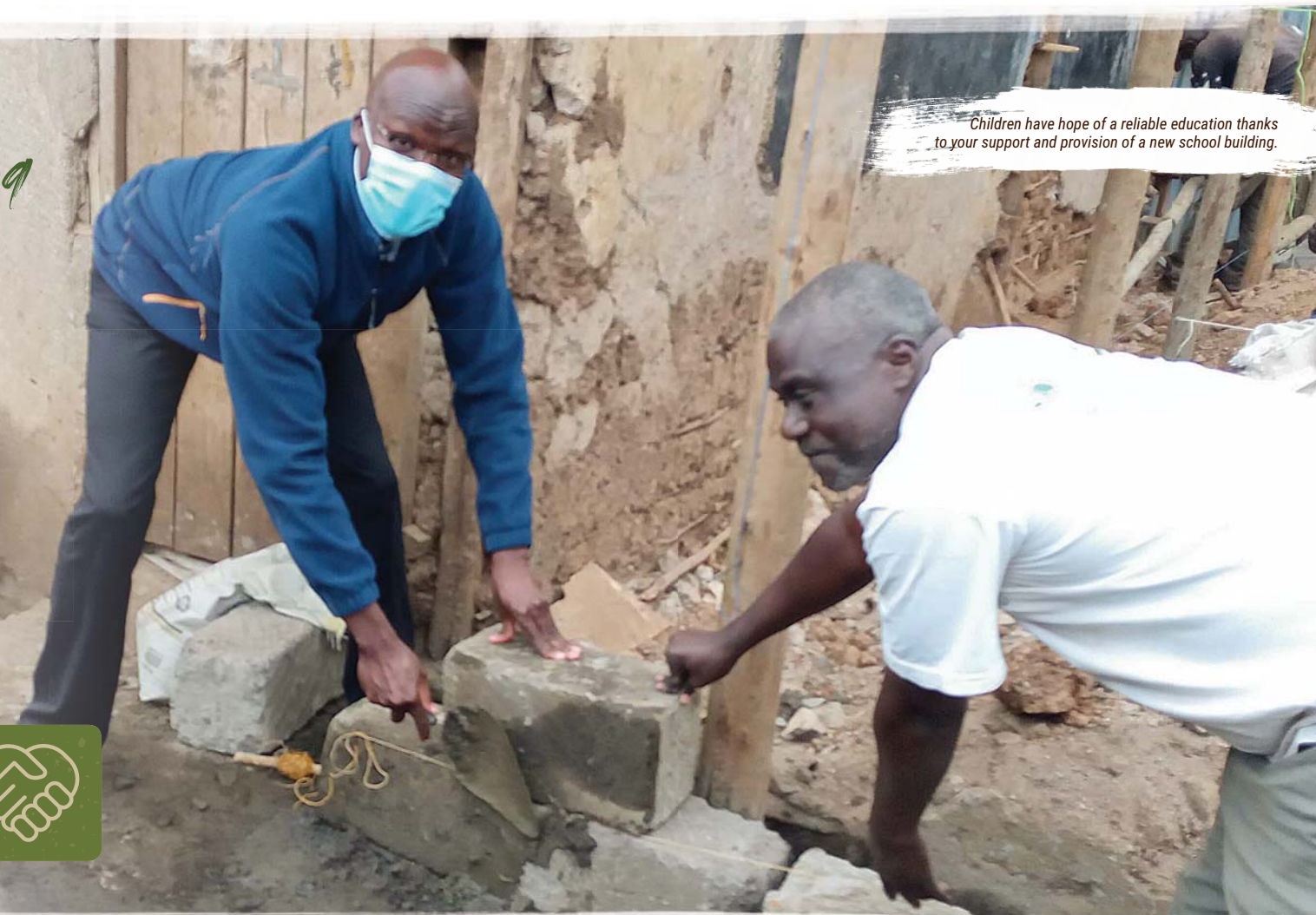
Children have hope of a reliable education thanks to your support and provision of a new school building.