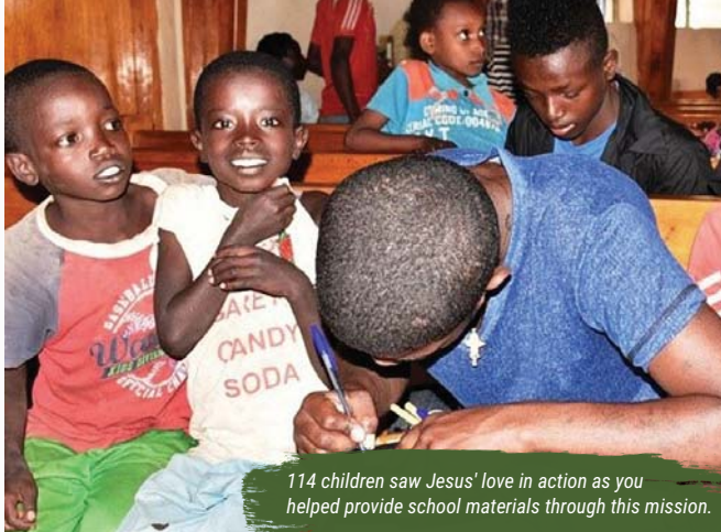
114 children saw Jesus' love in action as you helped provide school materials through this mission.