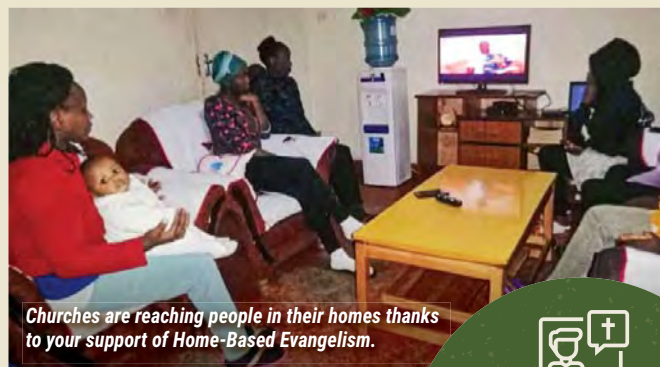
Churches are reaching people in their homes thanks to your support of Home-Based Evangelism.

"The church leadership has resolved to continue using the approach even beyond COVID-19 since we have seen the undeniable impact it has on both spiritual and numerical growth of the church."