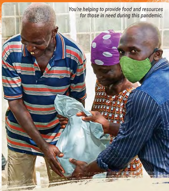
You're helping to provide food and resources for those in need during this pandemic.

"Indeed, by this unprecedented benevolent act, the presence of the Church has been felt so much even in the wake of the coronavirus pandemic and its attendant challenges."