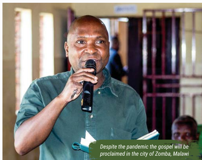
Despite the pandemic the gospel will be proclaimed in the city of Zomba, Malawi

The majority of people claim to have a religious affiliation with Christianity, but few have a personal relationship with Jesus. Sharing Jesus' love in Word and Deed in this city over the next three years will bring significant transformation to the region.