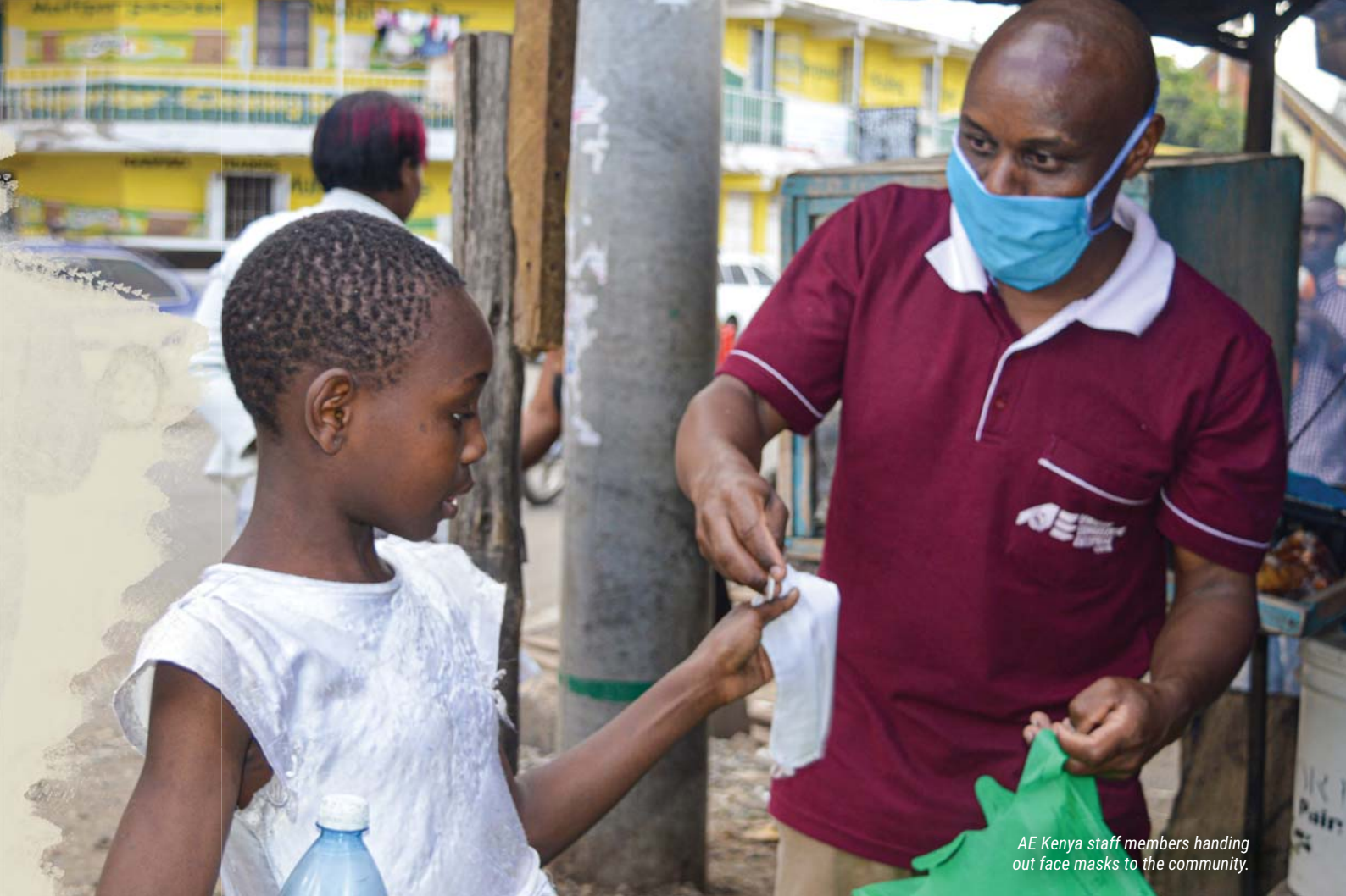
AE Kenya staff members handing out face masks to the community.