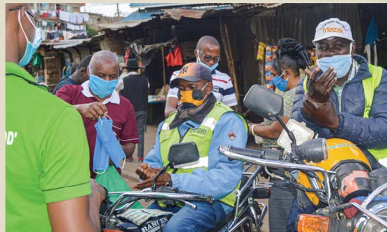
▲ Your support has enabled the distribution of face masks to communities in need.

Your generosity is also helping to provide food parcels through AE's Ghana team to impoverished community members and to offer special support for healthcare workers.