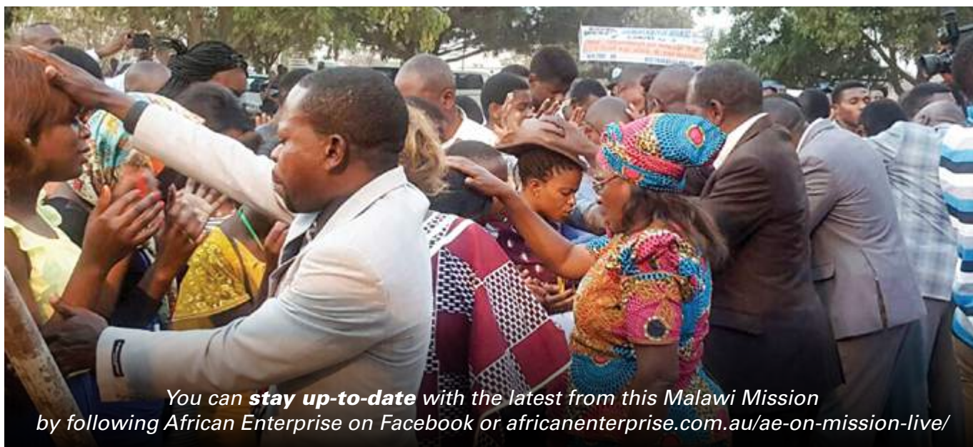
You can stay up-to-date with the latest from this Malawi Mission by following African Enterprise on Facebook or africanenterprise.com.au/ae-on-mission-live/

Please pray that God would bless this mission and use it powerfully to draw people to Himself!