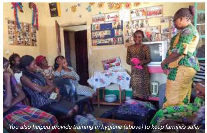
You also helped provide training in hygiene (above) to keep families safe.