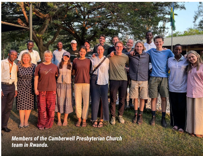
Members of the Camberwell Presbyterian Church team in Rwanda.

In Rwanda, I was confronted by injustice and poverty. However, I now have a new passion in my heart to be where God wants me and to do what he calls me to. I recently shared about the mission with others from our team at Donvale Christian College, in Victoria. Prior to the mission I wouldn't have considered doing something like this, but God took me out of my comfort zone and the materialism all around us in Australia. I was challenged by God as I saw that the Rwandan people I met were not materially rich, but they were incredibly spiritually rich.