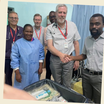
Doctors from Australia giving donated equipment to medical staff in Malawi.