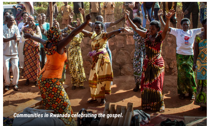
Communities in Rwanda celebrating the gospel.

As we shared the gospel in schools, farming communities, and open-air meetings, and served others by helping to build a house, there were so many times that I thought – “why didn't I do this sooner in my life?”