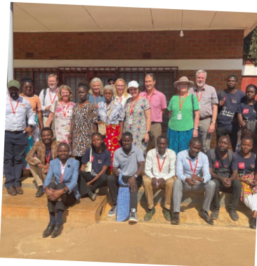
Medical mission in Malawi